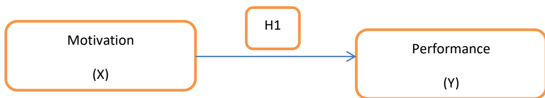
Figure 2. Research Framework

The following is the theoretical framework of correlation analysis to measure the relationship between the variables of attitude, motivation, satisfaction, and organizational culture on the performance of KSP Mekar Sai employees.